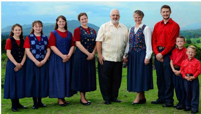
(The Craft family)