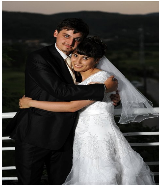
(One of their wedding pictures!)