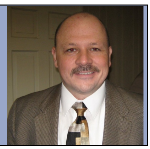
"For ye were as sheep going astray "~ 1 Peter 2:25

Two thousand sixteen is an election year and Christians seem to focus on little else at such times. Twelve years ago I wrote an article that resulted from a study of the Bible to discern what Scriptural directions a Christian has to guide them in making voting decisions. The article was entitled, "The Christian Voter's Guide." I received a little feedback from it, including a piece of hate mail in which I was called some ugly names by someone I don't know and didn't respond to. It reminded me of the intellectual level of a school yard exchange that includes many, I-know-you-are-but-what-am-I's. I guess they took their ball and went home because I haven't heard anything else from them. Oh well, life goes on, time heals all wounds, and all that.